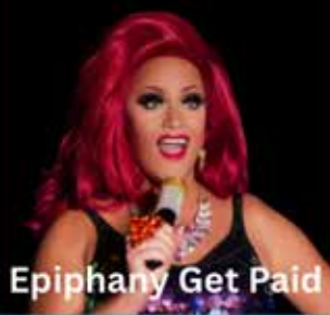
Epiphany Get Paid